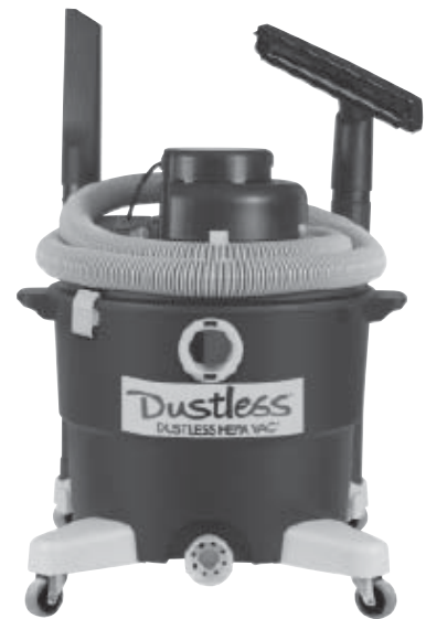
Hepa Wet+Dry Dustless Vac Model #D1603