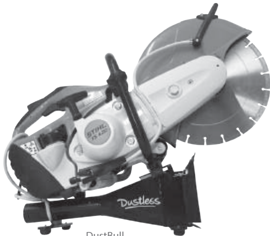
DustBull Model #D1765