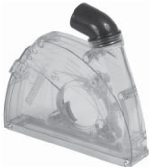
7" CutBuddie Model #D1750