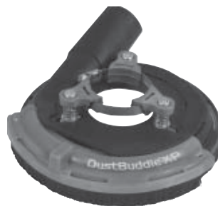
7" DustBuddie XP Model #D5850