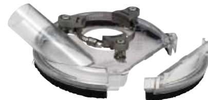
5" DustBuddie Model #D1835